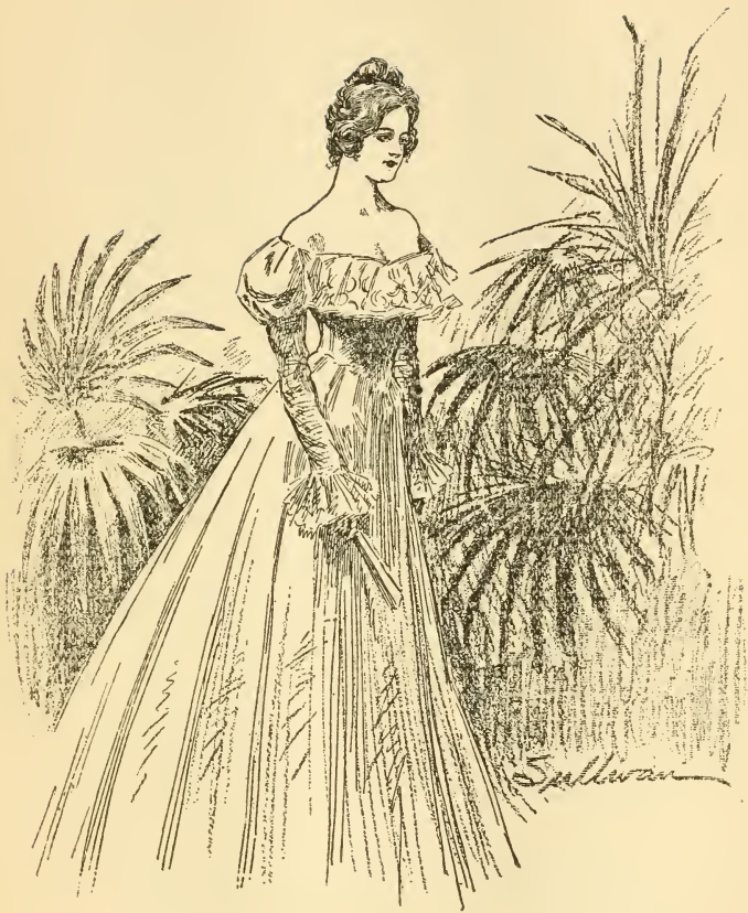
"The Washington Girl"